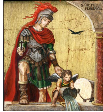
St. Florian Patron Saint of Firefighters