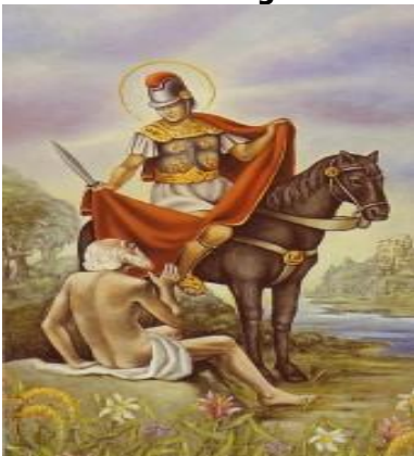
St. Martin of Tours Patron Saint of Military

There will be a reception immediately following the Mass; join us in meeting and thanking the men and women who risk their lives for us everyday.