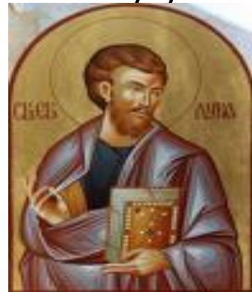
St. Luke Patron Saint of EMS

Sponsored by: Archdiocese of Santa Fe Pastoral Outreach Office, Your ACA Dollars At Work