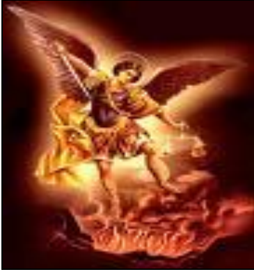
St. Michael Patron Saint of Police