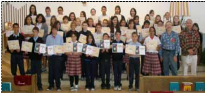
Pictured above are participants of John F. Kennedy Council 5729 Soccer Challenge.

The recommended time frame for the soccer challenge: council in September; district in October; state in November. During the past couple of years we have not had large council participation. This year we want to get the word out early, and our goal is to have the first ever state competition. I have received calls and questions in reference to the soccer challenge. If we work together, we can achieve our goal just like in the basketball free throw contest.