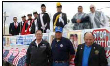
Several 4 th Degree Knights on and near the float before the parade started.